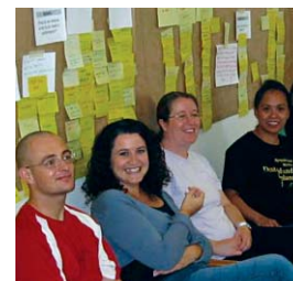
A SKILLED WORKFORCE